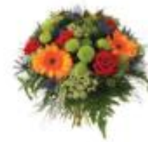
PLANTS & FLOWERS