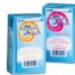
TETRA PACKS & JUICE BOXES