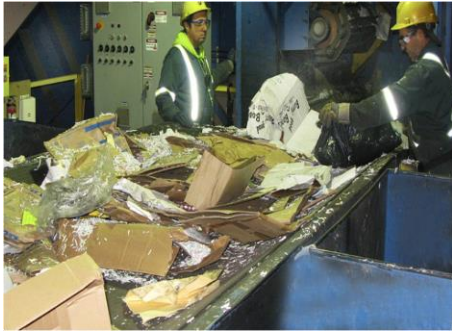
Material sorted across line