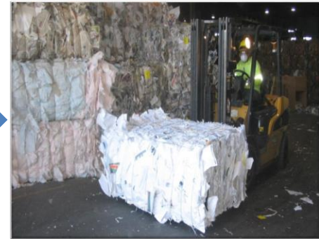
Bales loaded onto trailer and sent to end recycler