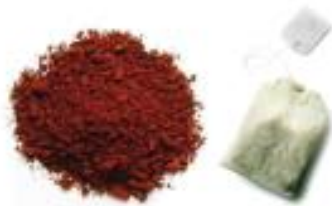
COFFEE GROUNDS & TEA BAGS