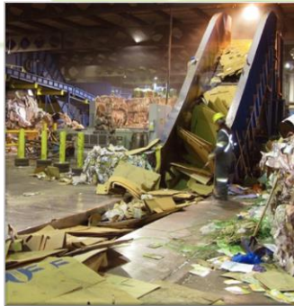
Compacted into cubes called bales